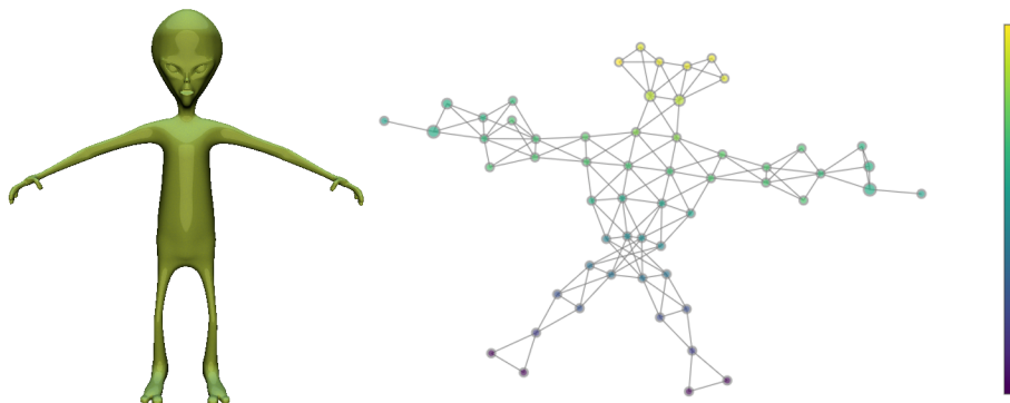
Figure 2: Mapper graph generated by giotto-tda based on the height of a 3D model. 5

and is only partially compatible with scikit-learn pipelines. Moreover, it does not implement memory caching or provide real-time hyperparameter interactivity in the visualization.