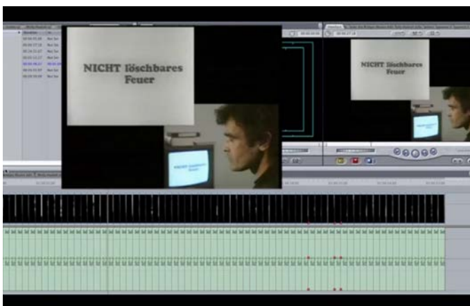
4 – Kevin B. Lee, Interface 2.0 , 2012, 8 mins. © Kevin B. Lee