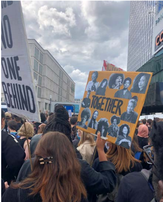
1 – Protest banner, “Silent Demo” against racism, 6 June 2020, Alexanderplatz, Berlin.