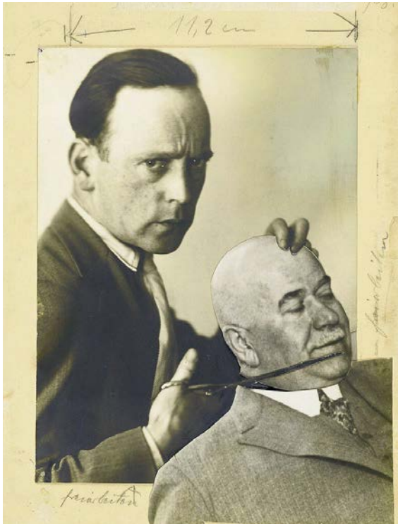
2 – John Heartfield, Use Photo as a Weapon (Self-Portrait with Police Commissioner Zörgiebel), 1929. © The Heartfield Community of Heirs / VG Bild-Kunst, Bonn, 2020, Akademie der Künste, Berlin

Making a direct contrast between at least two images appears to be the easiest, as well as the most effective, method to create a visual declaration of resistance. Montaging one image into another technically takes little to no time. You simply take a pair of scissors to Karl Zörgiebel’s throat (he was police commissioner of Berlin during the Blutmai or “bloody May,” in May 1929 – several days of rioting by supporters of the KPD (Communist Party of Germany) that ended in violent clashes with police). Here, the montage method corresponds to the temporality of resistance in the streets or in the factory, as though the time between the images creates a space for urgency to be fully expressed. By the mid-1990s, Harun Farocki had already developed the idea of “soft montage” in works such as Schnittstelle (Interface) 3 to do justice to the growing complexity of the visual realm. Images are not just images: they are extracts, comments, forms of communication, meta-data, data streams or even, in the best-case scenario, a visual commonality. Farocki’s “soft montage” is an answer to this situation: “I say ‘soft montage’ because it’s about a complex relationship, not just oppositions and similarities.” 4 In the short video essay Interface 2.0 , filmmaker and critic Kevin B. Lee creates a wonderful update of Farocki’s Schnittstelle that reflects and comments on the digitisation of this work using digital editing tools. 5 (ill. 3–4)