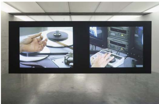
3 – Harun Farocki, Interface , 1995, 23 mins. © Harun Farocki GbR and Generali Foundation Collection – Permanent Loan to the Museum der Moderne Salzburg. Photo: Werner Kaligofsky

Making a direct contrast between at least two images appears to be the easiest, as well as the most effective, method to create a visual declaration of resistance. Montaging one image into another technically takes little to no time. You simply take a pair of scissors to Karl Zörgiebel’s throat (he was police commissioner of Berlin during the Blutmai or “bloody May,” in May 1929 – several days of rioting by supporters of the KPD (Communist Party of Germany) that ended in violent clashes with police). Here, the montage method corresponds to the temporality of resistance in the streets or in the factory, as though the time between the images creates a space for urgency to be fully expressed. By the mid-1990s, Harun Farocki had already developed the idea of “soft montage” in works such as Schnittstelle (Interface) 3 to do justice to the growing complexity of the visual realm. Images are not just images: they are extracts, comments, forms of communication, meta-data, data streams or even, in the best-case scenario, a visual commonality. Farocki’s “soft montage” is an answer to this situation: “I say ‘soft montage’ because it’s about a complex relationship, not just oppositions and similarities.” 4 In the short video essay Interface 2.0 , filmmaker and critic Kevin B. Lee creates a wonderful update of Farocki’s Schnittstelle that reflects and comments on the digitisation of this work using digital editing tools. 5 (ill. 3–4)