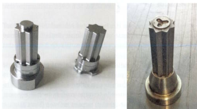
Figure 1 Left: Original star-shaped inserts of the production mould. Right: Test insert for studying the effect of surface treatments on the demoulding properties. All parts are made in stainless steel (1.2379).

A series of tests was made using star shaped cores made of K110 Böhler Steel (1.2379) and using seven different polymers. A series of cores was modified by laser texturing strategies to obtain different surfaces to be tested in real injection processes. Here, the laser textures are described by their corresponding surface roughness ( S_a ). The roughness scale was chosen to cover surfaces with low values of S_a (0.5–0.9 \mu\text{m} ). Although the surface topography cannot be defined only by its roughness value, a trend was observed.