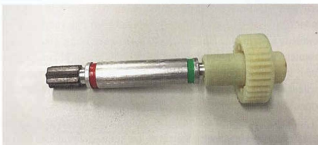
Figure 4: Example of a key quality control test of the star shaped axis of the plastic part. The plastic parts produced using the laser textured inserts fulfilled this quality criterion, even after reducing the cooling time by five seconds.

The validation tests showed that the cooling time can be reduced by 5 seconds when the laser textured insert is used instead of a standard surface-finished insert. Thus, the total injection cycle time could be reduced from 33 seconds to 28 seconds, corresponding to a productivity gain of 15 %.