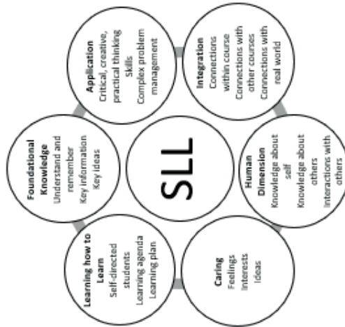
Figure 3. Dimensions of Finck's Significant Learning for Significant Lifelong Learning.