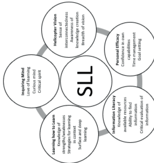
Figure 2. Lifelong Learning Attributes for Significant Lifelong Learning. Source: Adapted from Candy, Crebert, and O'Leary (1994)