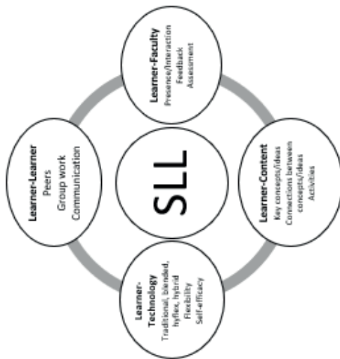
Figure 1. Learning Interactions for Significant Lifelong Learning.

of interactions, dimensions, and attributes that ultimately lead to a framework for significant lifelong learning.