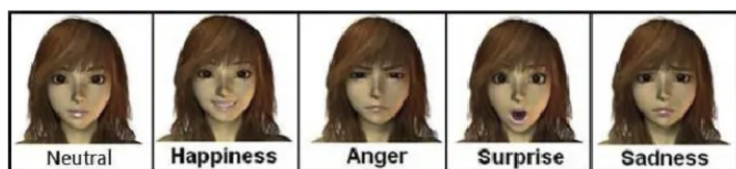
Figure 1. Facial expressions of the avatar [32]

is certainly a great interest in developing new technologies of this kind.