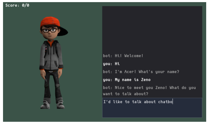
Figure 3. The chatbot client showing a calm ACER conversating with the user.

To develop the client, we used Godot, a free and open-source game engine. The reasons for using a game engine are the availability of means both to create an interface and to display an avatar and the ease of interaction between the different components. The client basically takes care of receiving the user’s input to send it to the chatbot and show the response. It can be divided into three components: the chat,