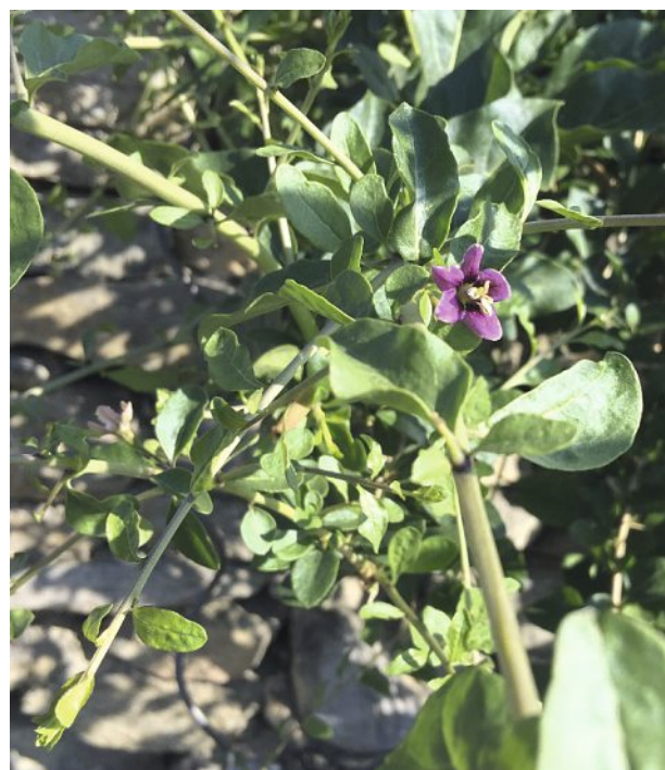
Fig. 1. Stems, leaves and a flower from goji plant.

Beside the already identified bioactive compounds, a novel stable ascorbic acid (AA) analogue named 2-O- \beta -D-glucopyranosyl-L-ascorbic acid (2- \beta -gAA) has been recently