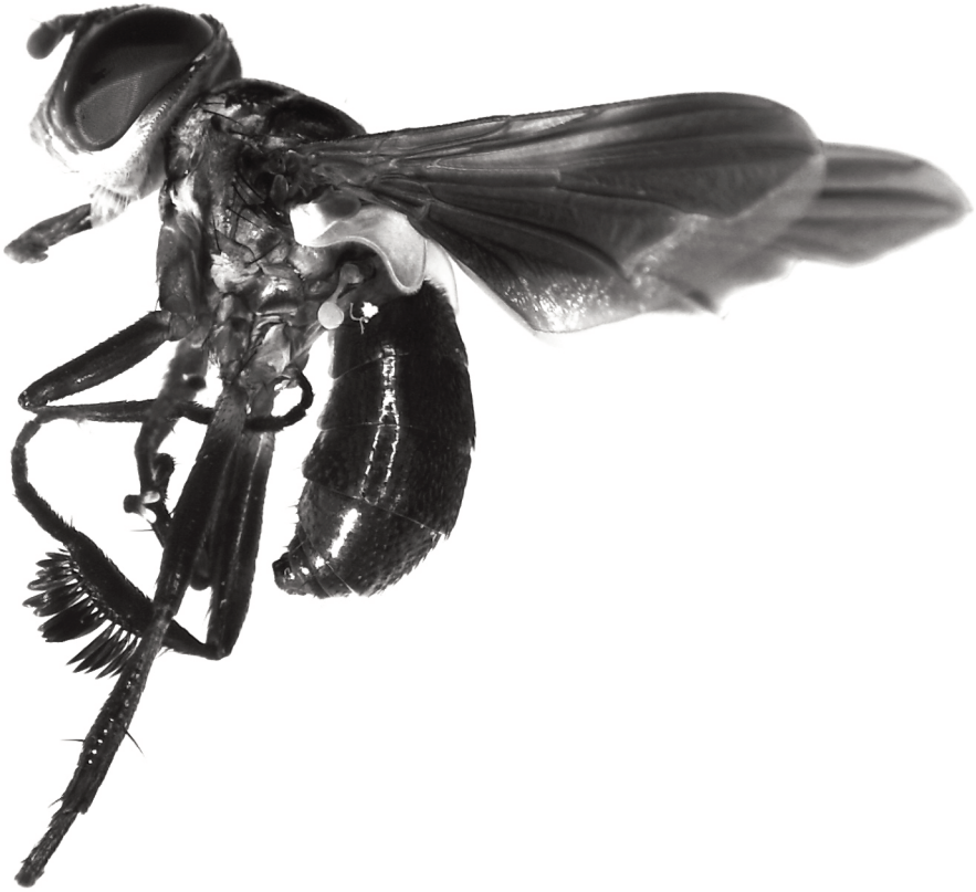
Fig. 2: Female of Trichopoda pennipes that emerged from the specimen of N. viridula in August 2015.

meaning that eggs probably had been laid on the late-instar nymph of the bug. Finally, several adults of N. viridula were collected in eggplant tunnels at Monniaz (Geneva, 512.611 / 121.873, 1.x.2015) and placed in constant room temperature of 23°C at the UASWS. None of them showed eggs on their body. However, a puparium of T. pennipes was found in the box on 28 October 2015. The two last puparia did not produce adult flies during the redaction of this paper.