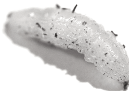
Fig. 4: Maggot of Trichopoda pennipes after its emergence from the bug (Photo by Gaëtan Jaccard, 2015).

The SGSB is native to Mediterranean and/or Ethiopian regions (Todd 1989). In Europe it has recently become established in non-Mediterranean countries: Hungary, the United Kingdom, Germany and Switzerland (see Rabitsch 2008). It has also been found in Austria, Belgium and Finland, where it is, however, considered as not yet established (Rabitsch 2008). In Switzerland this invasive bug is present, at least occasionally, in most of low altitude areas. In the canton of Geneva, it is