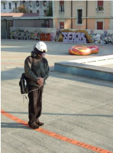
Figure 5: A blindfolded individual following a red sinuous path using the See ColOr guidance.