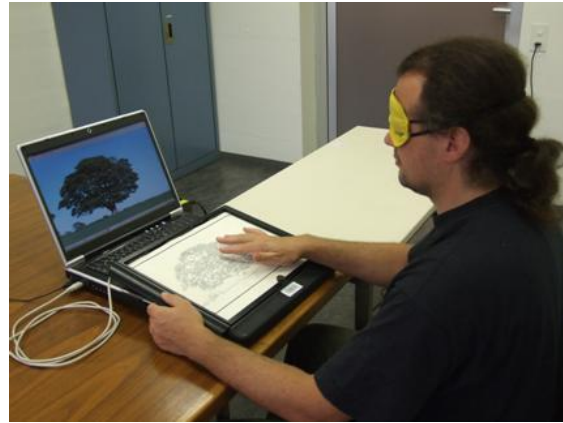
Figure 3: Example of an embossed picture on the T3 tactile tablet.

In the first step of the See ColOr project, we performed several experiments with six blindfolded persons who were trained to associate colors with musical instrument sounds [4]. As shown in Figure 3, the participants were asked to identify major components of static pictures presented on a special paper lying on a T3 tactile tablet representing pictures with embossed edges, http://www.rncb.ac.uk/page.php?id=872 . Specifically, this tablet makes it possible to determine the coordinates of a contact point. When one touched the paper lying on the tablet, a small region below the finger was sonified and provided to the user. Color was helpful for the interpretation of image scenes, as it lessened ambiguity. As an example, if a large region “sounded” cyan at the top of the picture it was likely to be the sky. Finally, all participants to the experiments were successful when asked to find a bright red door in a picture representing a churchyard with trees, grass and a house.