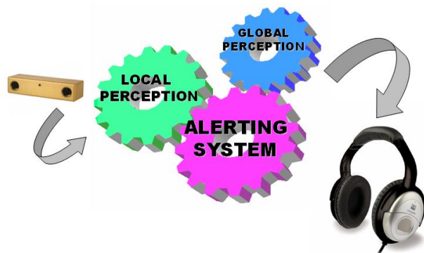
Figure 1: Decomposition of the See Color mobility aid into three distinct modules (colored engines). The input (stereoscopic camera) and output (headphones) peripherals are shown at either side of the schema.

Thanks to this global module the user will be able to discover the main components of an image and determine their relative position while a global perception of the environment will be built in the user's mind. This will be achieved by means of a small touchpad that will activate the auditory representation of the image being taken by the camera in real time. The prototype allows the user to navigate both indoor and outdoor spaces by listening to the sound of the references points chosen by her/him self via touching. Notice also that the final See Color prototype presents a sonification method that renders not only colors but also depth information thanks to the use of a stereoscopic (or time-of-flight) camera. In the See Color prototype, depth is represented by sound duration; the more prolonged the sound, the farther the touched point.