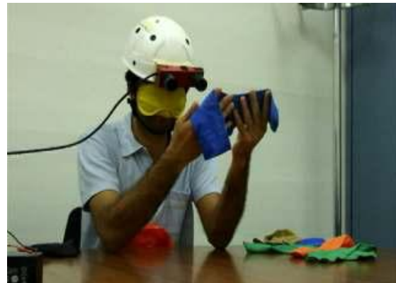
Figure 4: A blindfolded subject observing a blue sock.

The work described in [5] introduced an experiment during which ten blindfolded individuals participants tried to match pairs of uniform colored socks by pointing a head mounted camera and by listening to the generated sounds. Figure 4 illustrates an experiment participant observing a blue sock. The results of this experiment demonstrated that matching similar colors through the use of a perceptual (auditory) language, such as that represented by instrument sounds can be successfully accomplished.