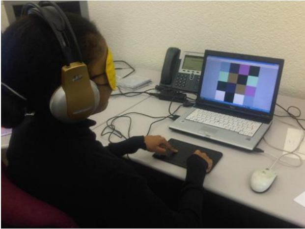
Figure 7: A blindfolded individual playing the memory matching game of colors.