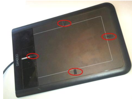
Figure 6: The SeeColOr -global-module touchpad on which images are represented. The circled areas are the four markers indicating the middle of the edges of the sensitive area.

We conducted experiments on 20 blindfolded persons tasked to play the game until complete the three levels. Every participant was given around 10 minutes of initial training as it was the first time they tried it out. Moreover, four markers were attached to the touchpad indicating the middle of the edges of the squared sensitive area; this gave users a measurable notion of the central position up, down, right and left of the image.