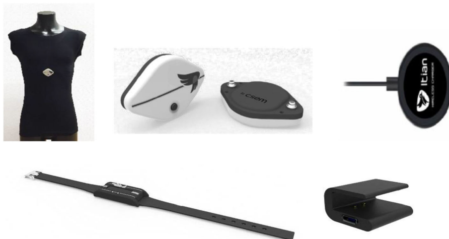
Fig. 1 This figure shows PEGASO smart garment and a wrist-worn activity tracker

This app allows the participant to enter information about their diet and provides feedback about the balance and diversity of consumed food (Fig. 3). It aims to