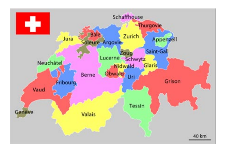
Carte des cantons Suisse

Even on Switzerland's level, there are significant variations. Inter-cantonal differences concern the maximum amount allowed for exemption (ranging from 5% of income in Neuchâtel to 100% in Bâle-Campagne), and the limitation or not for foundations to conduct their activities outside of their canton or of Switzerland itself. Furthermore, if certain cantons only consider donations over 100.-, others, in contrast, have no limit regarding the minimum amount of a donation. Differences also concern the flexibility given to cantonal fiscal authorities, while some cantons have strict limits regarding the maximum percentage of taxable income eligible for exemptions, others give cantonal authorities the possibility to increase the percentage on a case by case basis [12].