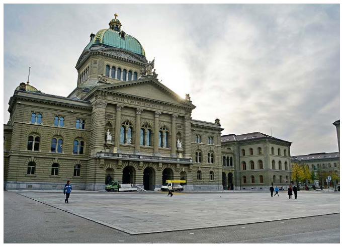
Photo: Bundeshaus, Parlement à Bern en Suisse

On to the lawyer's side, taking an interest in foundations or philanthropy, law professionals, mentioning the contribution capacity principle [44], also offer various legislative reforms known as "legislation of interest." These reforms may address the Law of Foundations and the requirements opening the possibility of tax exemptions for charitable purposes [45] and more specifically on the tax system [46]. Lawyers rarely question the tax relief system itself; Mettrau claims that tax exemption for charitable organizations must be considered to follow tax fairness: "Tax fairness justifies that we exempt an institution working towards the same goal as the community collecting the tax. If collecting funds is a State duty that will enable it to carry out its tasks, tax exemption for charitable organizations performing similar activities should not constitute an obstacle to this fundamental principle." [47] More broadly, proposals to "improve" the legislative framework are generally going toward more permissibility. For Oberson for example, an increase in recovery rates is warranted because "values have been shifting and the Swiss society is readier [than before] to accept an increase in recovery rates."[48] The widespread interest of citizens and politicians in philanthropic actions would