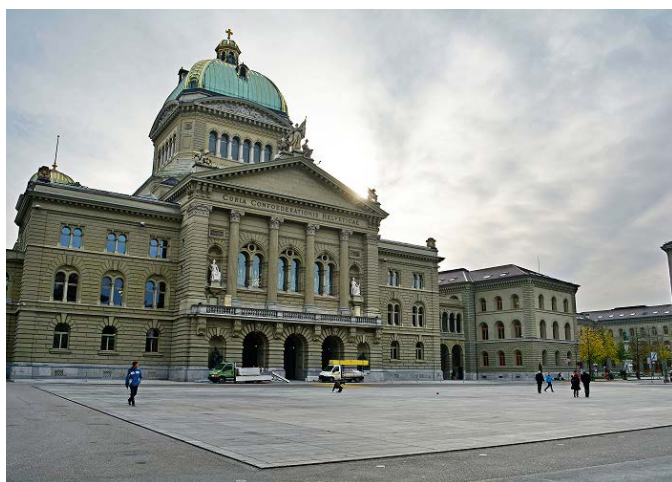
Photo: Bundeshaus, Parlement à Bern en Suisse

On to the lawyer’s side, taking an interest in foundations or philanthropy, law professionals, mentioning the contribution capacity principle [44], also offer various legislative reforms known as “legislation of interest.” These reforms may address the Law of Foundations and the requirements opening the possibility of tax exemptions for charitable purposes [45] and more specifically on the tax system [46]. Lawyers rarely question the tax relief system itself; Mettrau claims that tax exemption for charitable organizations must be considered to follow tax fairness: “Tax fairness justifies that we exempt an institution working towards the same goal as the community collecting the tax. If collecting funds is a State duty that will enable it to carry out its tasks, tax exemption for charitable organizations performing similar activities should not constitute an obstacle to this fundamental principle.” [47] More broadly, proposals to “improve” the legislative framework are generally going toward more permissibility. For Oberson for example, an increase in recovery rates is warranted because “values have been shifting and the Swiss society is readier [than before] to accept an increase in recovery rates.”[48] The widespread interest of citizens and politicians in philanthropic actions would