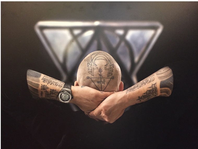
Appendix 13 : Maxime Pleschia-Büchi tattooing for Hublot