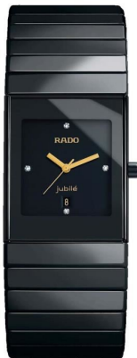
Appendix 2 : Rado Ceramica