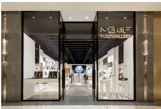
Appendix 8 : MAD Gallery Dubai