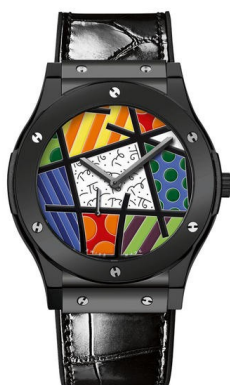
Appendix 11 : Hublot Big Bang designed by Romero Britto