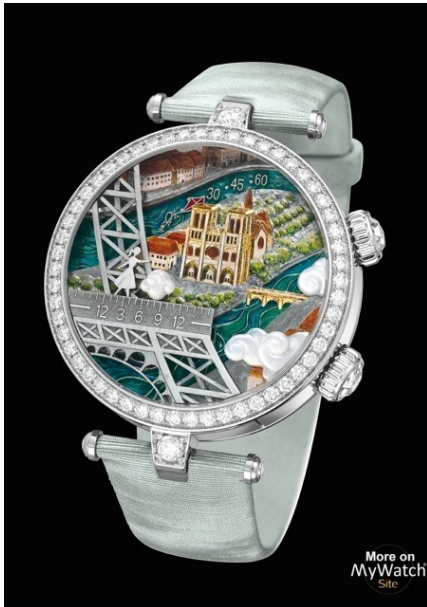
Appendix 6 : Lady Arpels Poetic Wish