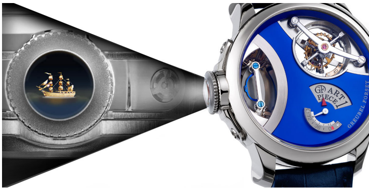
Appendix 10 : Greubel Forsey Art Piece One