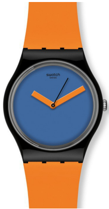
Appendix 1 : Swatch original