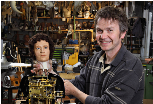
Appendix 9 : Automaton Pouchkine made by François Junod