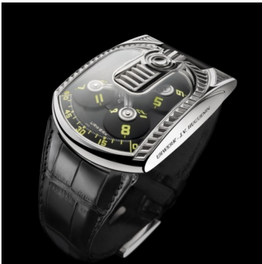
Appendix 5 : Urwerk UR-103 Artdeco