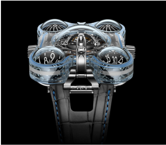
Appendix 4 : MB&F Horological Machine Alien Nation