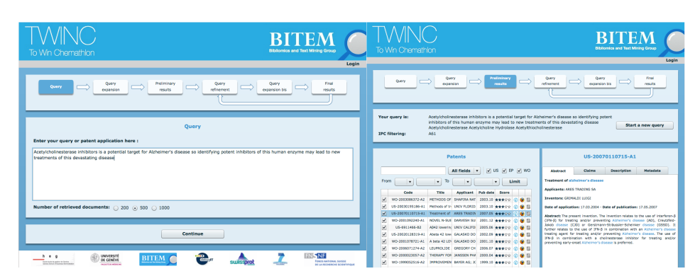
Figure 3. Prototype of TWINC

The TWINC application is freely available for non-commercial use at http://casimir.hesge.ch/TWINC (Figure 3). Evaluated within the PatOlympics competition (Table 1), we obtained two successive years the jury's choice out of five participants for its usability. Concerning the performances, we were ranked first out of two teams in 2010, and second in 2011, again with two participating teams.