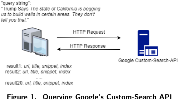
Figure 1. Querying Google's Custom-Search API

evidence related to their queries. Taking these features of Google's results into account, our hypothesis is the following: for legitimate news, the links that appear at the top of the results are the most trustworthy, and likewise, for fake news, the links that appear at the top of the ranking are the less trustworthy. With this hypothesis in mind, we started to work our way to obtain meaningful features from the metadata provided by Google's Custom-Search API.