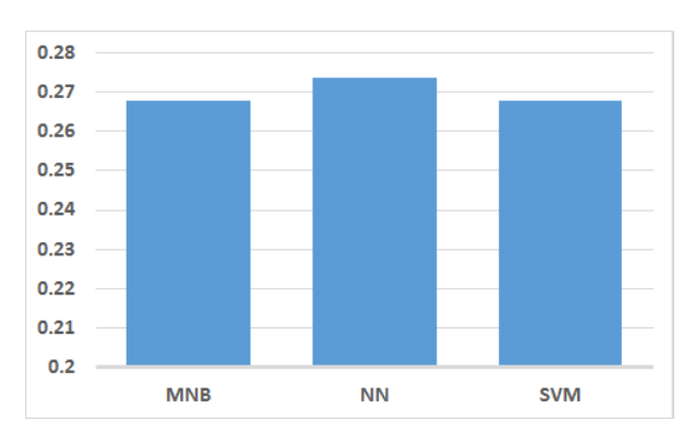
Figure 3. F1 scores using all features and Multinomial Naive-Bayes (MNB), Neural Networks (NN), and Support Vector Machine (SVM)

Figure 3 shows the results of the first experiment using all our features. The results (around 27% F1) are not satisfying and even lower than the state of the art. To understand the reasons of behind this, we performed