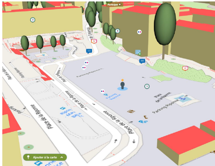
Figure 1 : The 3D platform as the core of interactions between citizens. On this screenshot we can see varying content displayed as icons : comments, uploaded pictures, screenshots, historic photographs and flickR posts.

Today only very few open Government projects focus on 3D visualization. One example is the Cityplanner project ( cityplanneronline.com ), which provides features such as the possibility to visualize 3D buildings and to communicate with the citizens regarding future projects.