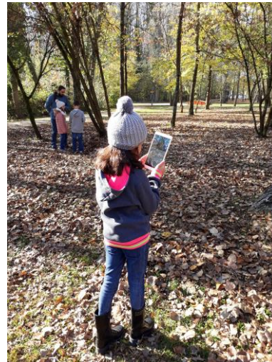
Figure 3: Evaluation of the application during a class trip

Moreover the screen of each mobile device was recorded and events related to the utilization of the application were stored in the database of the application, e.g.: when and where the application was started, paused or resumed, the augmented reality interface was started or closed, the reference map was opened or closed, the modal related to a species of a point of interest is opened or closed, or when a user has confirmed that he has identified the point of interest in the “real world”. Based on the videos, the screencasts and the cleaned log database, several responses we were able to discuss the hypotheses.