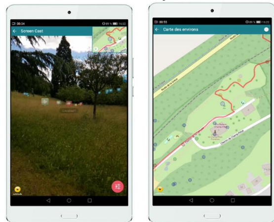
Figure 1: Screenshot of the AR mode of BioSentiers and the 2D map

The main objective of BioSentiers is to connect 9-12 y.o. pupils with the nature, and motivate them to learn about biodiversity.