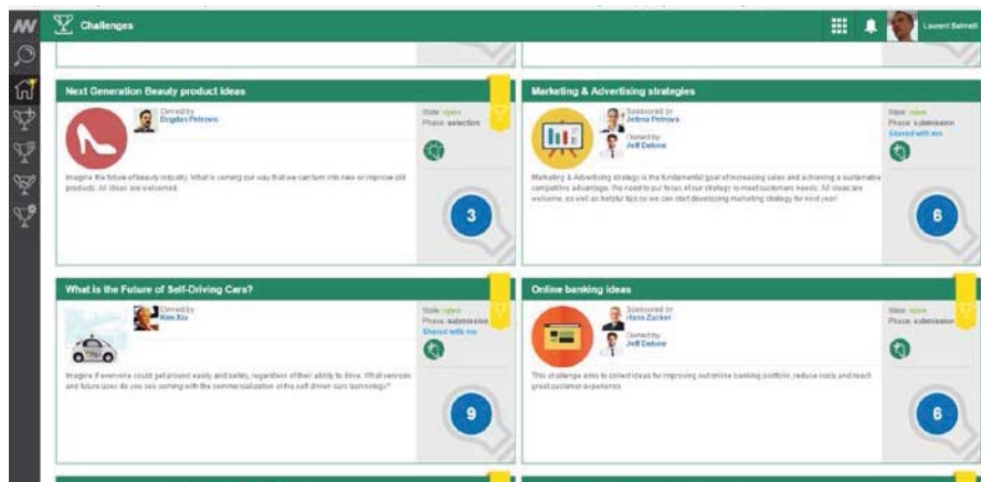
Figure 3 Screenshot of the open innovation platform

Idea categories, research and analysis work are systematically stored and rendered fully searchable in order to be leveraged in future efforts. In addition, we aim at continuously defining and refining metrics, as well as methods such that we can assess key performance indicators around project efficiency and idea maturity. Indeed, the large number of ideas and attached artifacts enables us to perform qualitative research (e.g. using classification) to draw conclusions between the creative process and project success.