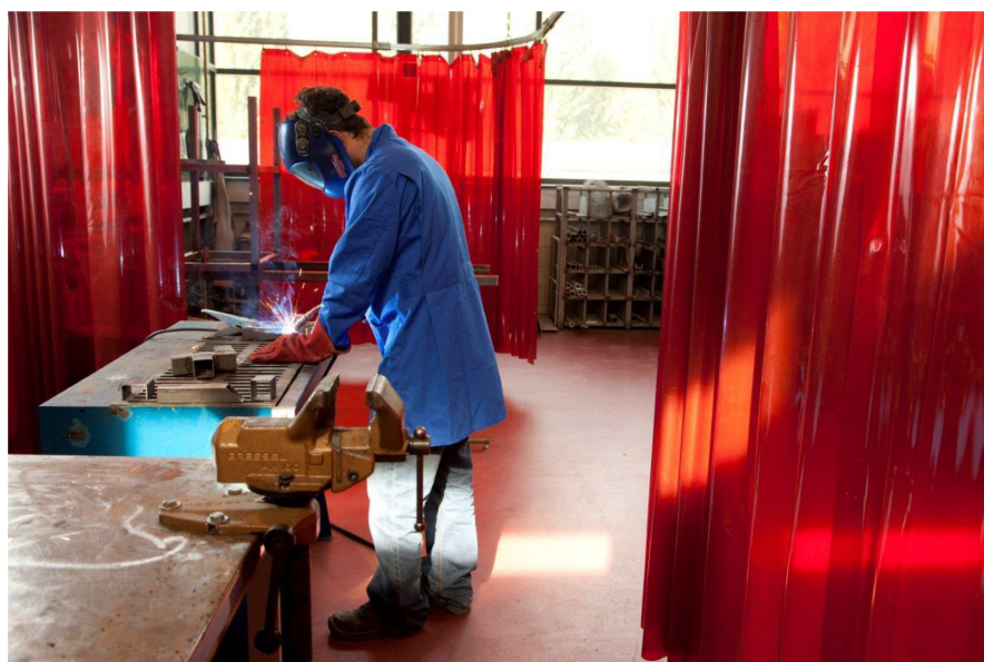
FIGURE 1 Vocational Workshop (welding workshop).

The semi-structured interviews investigated the patients' representations and practices, accident trajectory, experiences, and expectations towards the rehabilitation program as well as socio-demographic data. The combination of the two methods allowed for cross-referencing the two datasets to highlight the coherence between perceived