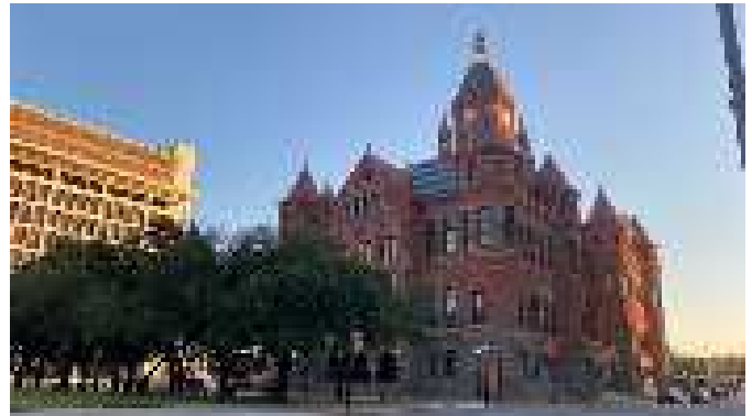
City of Fort Worth, Texas

This Congress has been hard work and stressful, but it was also very successful with great achievements, leaving me with lots of mixed emotions, I am especially proud of all the WCET® team members who have achieved so much during this long week of voluntary work. See you all soon in Glasgow, 2024!