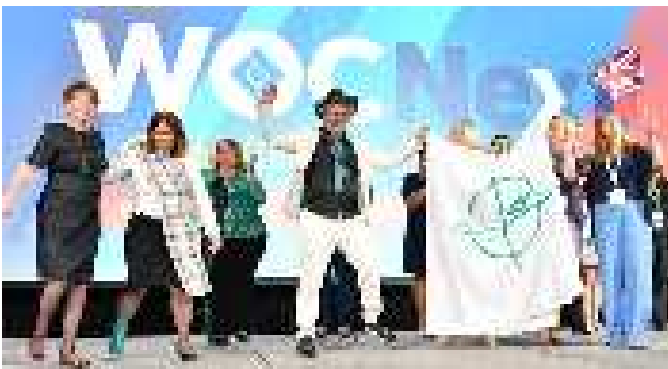
Giving (again) the WCET® flag to our ASCN-UK colleagues