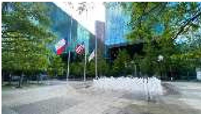
Fountain, Fort Worth, Texas