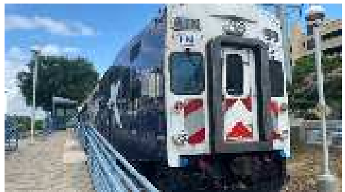
The Trinity Railway Express (TRE) train going from Dallas to Fort Worth (1 hour trip)