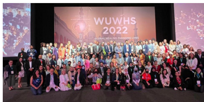
WUWHS closing ceremony