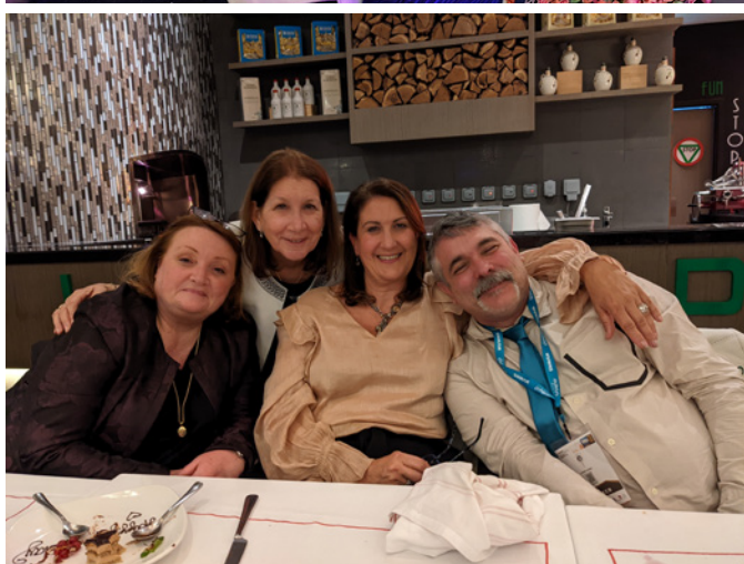
WCET® team happy at the end of a busy successful day