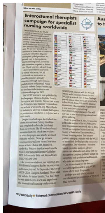
Every day a piece was written about us on the WUWHS daily newspaper