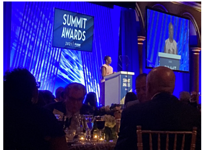
ASAE's Annual Power of A – Summit Awards ceremony