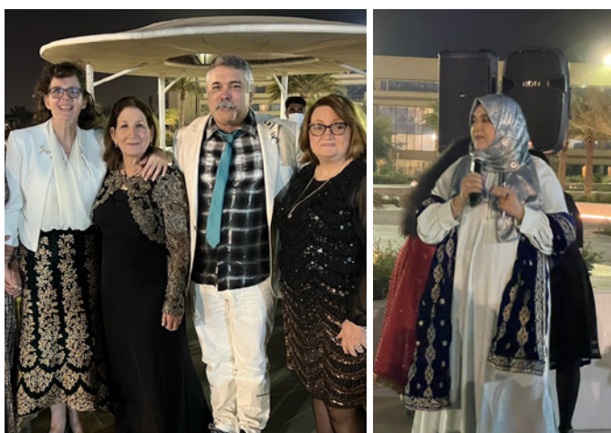
WUWHS gala dinner