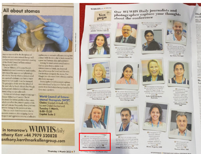
WCET® makes the news at WUWHS