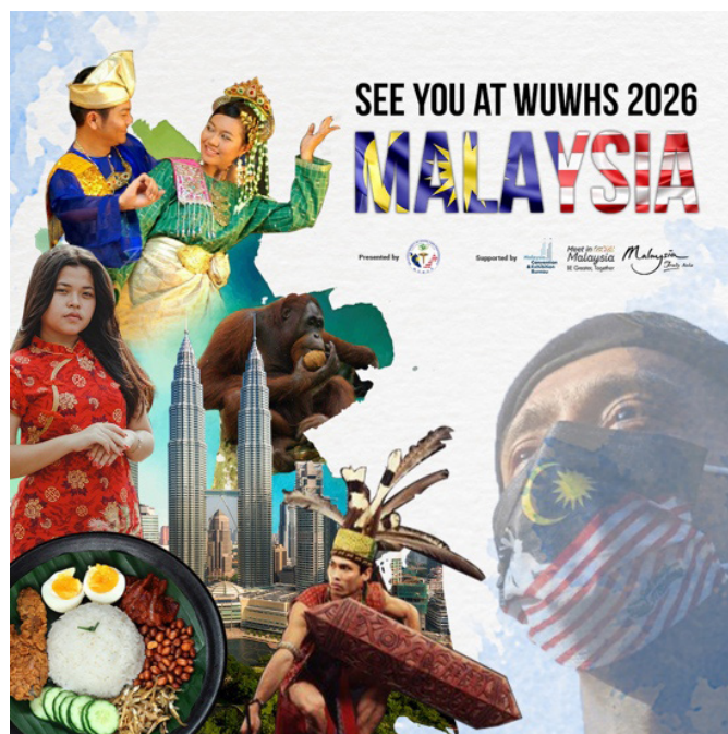
Malaysia wins WUWHS 23–27 September 2026 conference