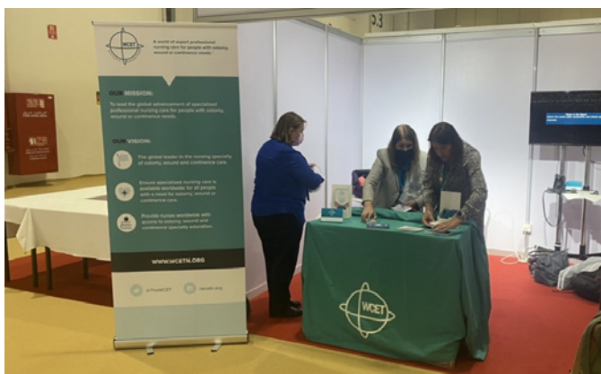
WCET® team busy building the booth

The event attracted over 4000 in-person registrants, making for lots of activity at the WCET® booth. Both members and supporters were able to pass by and pick up the most recent publications, allowing us to promote the association and its numerous activities. We also promoted WCET® with industry by going from booth to booth to explain our global mission and vision.