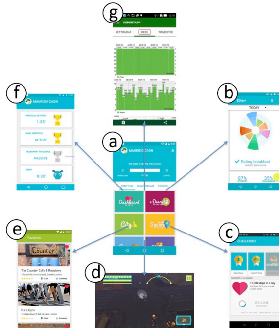
Fig. 3. The PEGASO mobile ecosystem.