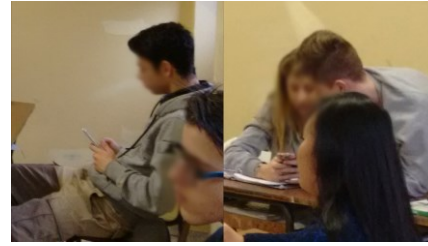
Figure 3. Users testing the serious game during phase 4.

The final pilot will include about 300 teenagers coming from the same four regions (Italy, Spain, England, and Scotland) for a duration of more than 6 months. Via this