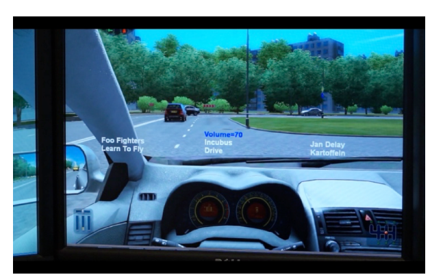
Figure 1. Head-Up Display Interface in a music player item.

In the HUD system, we implemented a menu layout similar to the Cover Wheel Layout (but with no 3D effect) [17], as shown in Figure 1. As shown by Mitsopoulos-Rubens et al. [17], this layout structure should not have an impact on performance compared to a list layout, often used in other HUD interfaces. The items of the list are displayed horizontally, with the selected item in the center, highlighted. The HUD was implemented only for the