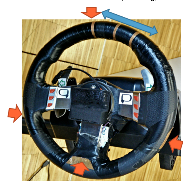
Figure 2. Logitech G27 Steering Wheel equipped with capacitive sensors, also called WheelSense. Red arrows depict hand-taps and blue arrow the hand-swipe.

• Volume UP: hand swipe (toward the top) on the external part of the right side of the steering wheel;