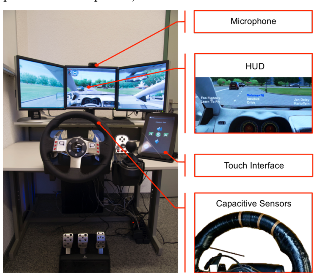
Figure 4. Experimental setup

For measures of user performance and subjective user ratings, a one-factorial analysis of variance (ANOVA) was carried out, followed by explorative post-hoc comparisons, for which a Bonferroni correction was applied. For most variables, distribution of the data meets normality assumption (e.g., DALI, driving time, measures of affect, SUS usability), there are however several measures that do not (i.e., SUS learnability, no. of accidents). Since our sample is not too small, the sample size is equal in each experimental group (N = 20) and kurtosis is most often rather small, we applied an ANOVA because this method tends to be robust if sample sizes are equal in the different experimental conditions. For the analysis of the data on participants' affective states, a one-factorial analysis of covariance (ANCOVA) was carried out, with the initial baseline measure (taken prior to task completion) used as covariate.