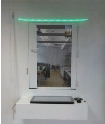
Figure 2. The Tangible Interactive Window installation in Biarritz, France, seamlessly integrated in the environment and connected to the University of Applied Sciences of Western Switzerland, in Fribourg.