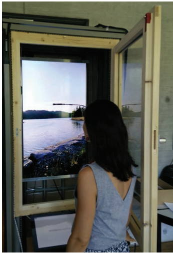
Figure 1: A demonstration of the Virtual Tourism Concept. A Tangible Interactive Window playing a HD portrait video of a natural landscape.