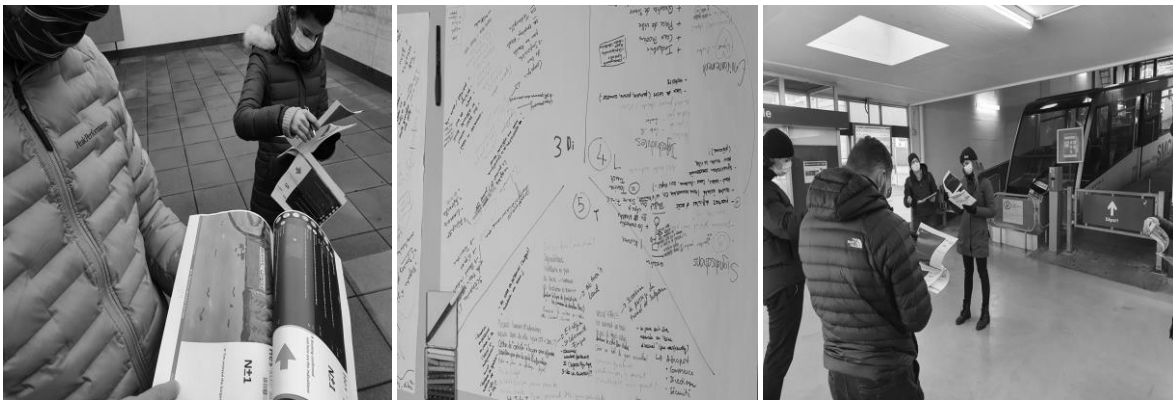
Figure 3. Re-enactment (staging) of the chosen N-1 N+1 scenario and C-sketching for feasibility testing purposes