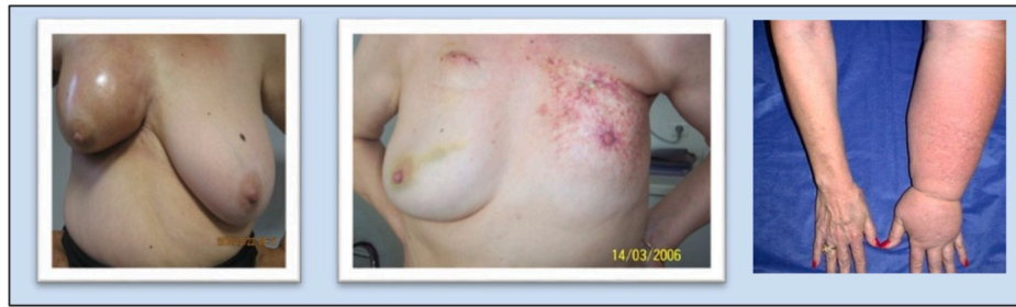
Fig. 1. Severe cases of late toxicity after radiotherapy for breast cancer (left; breast atrophy, centre: fibrosis, right: arm lymphedema).